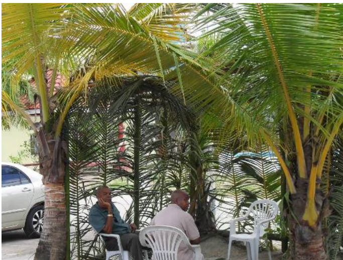
Two Brothers spending time in the sukkah