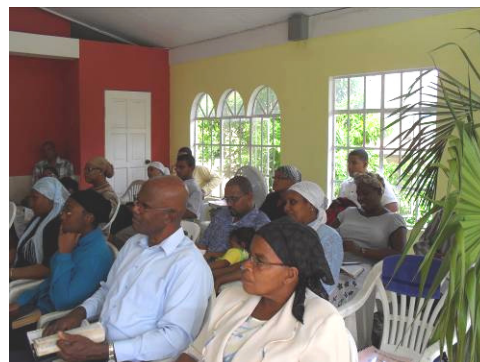
Brethren in attendance

"...You shall rejoice before Yahweh your Elohim seven days,"