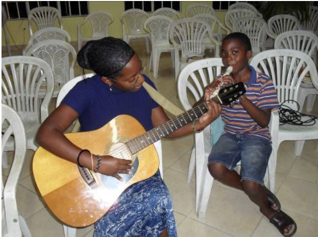
A stringed instrument to praise Yahweh