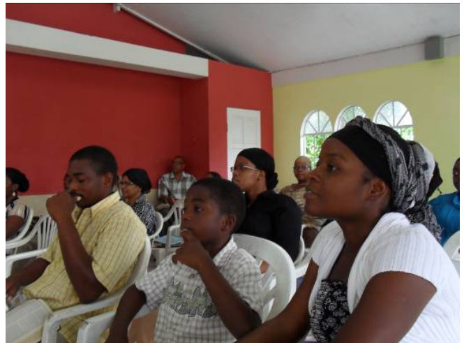
The brethren during Shabbat service